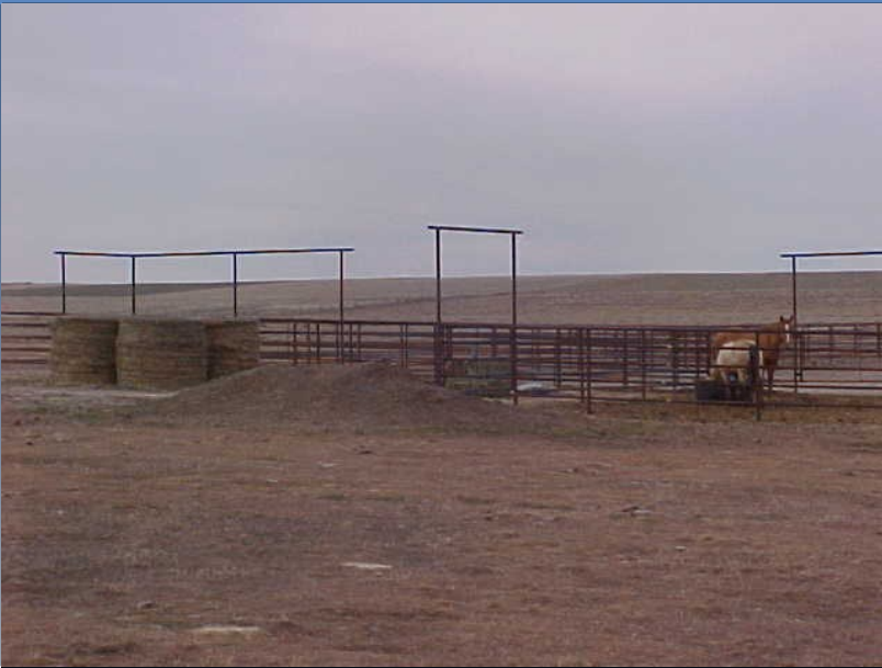
New pipe arena with attached corrals and automatic waters for livestock.

New bi-level modular home with full basement. 4 bedrooms and 2 baths with laundry room all on the main level. There is a two car attached garage. The backyard is fully fenced with a lawn. Front yard has a drip line for the shrubs.