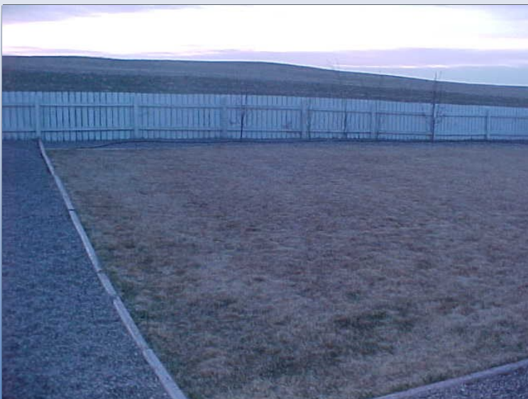
Nice wood fenced back yard with graveled play area.