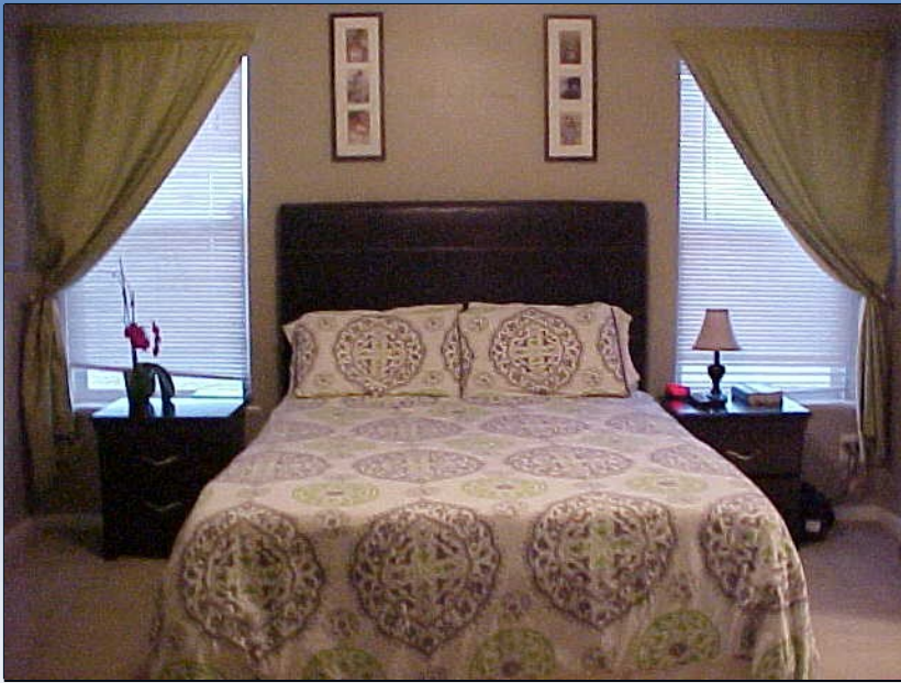
Beautiful master bedroom with a walk-in closet and attached master bath with a large built in bathtub and double sinks in the vanity.