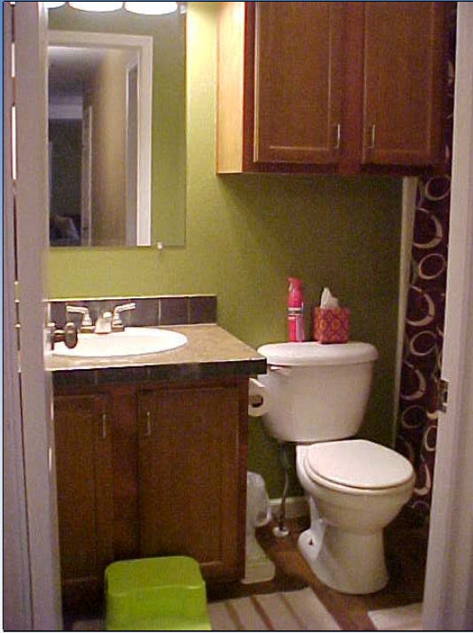
Second full bathroom