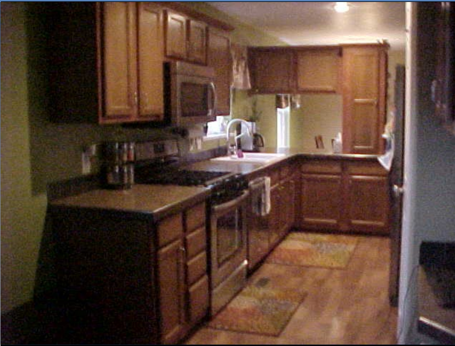
Beautiful kitchen with stainless steel appliances,, built in microwave oven, large kitchen sink, and opens to the dining area.