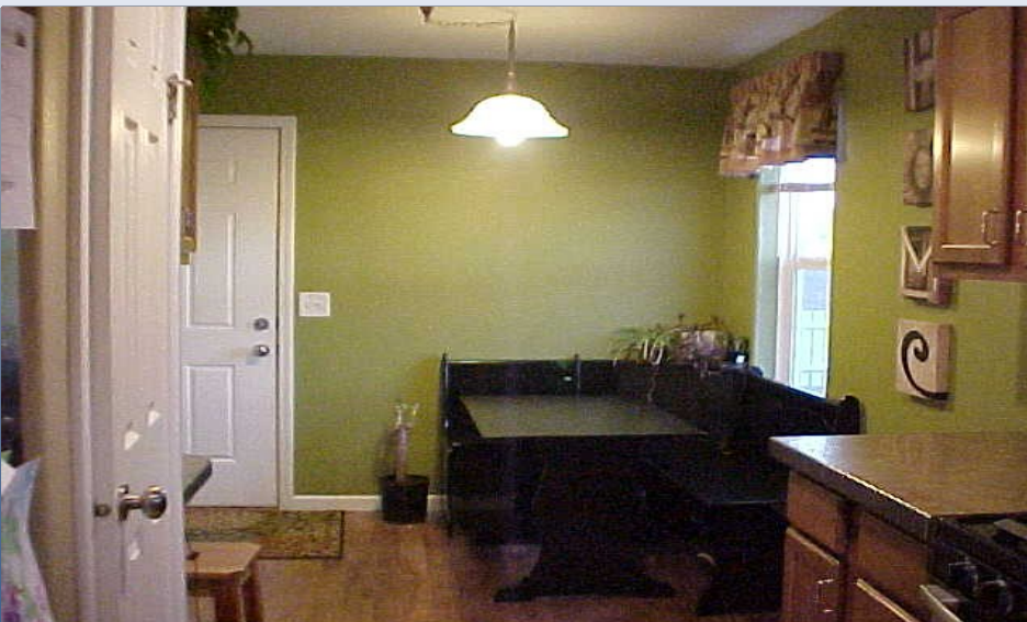
Breakfast nook with a window that looks out into the backyard of the home.