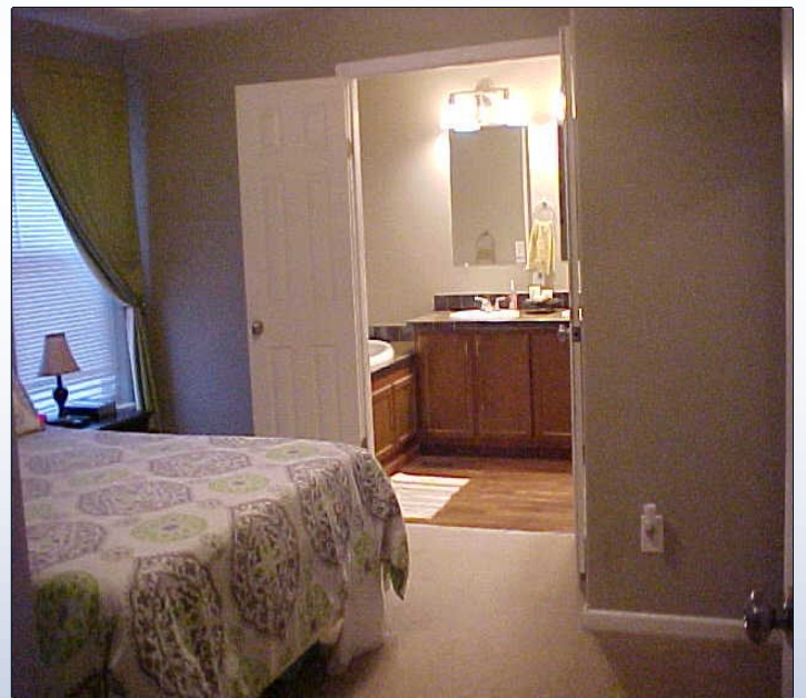
Tastefully done master bath