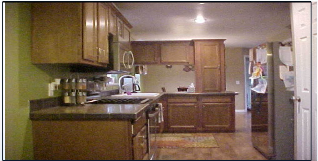
Kitchen area with excellent lighting and the laundry room is just off the kitchen.